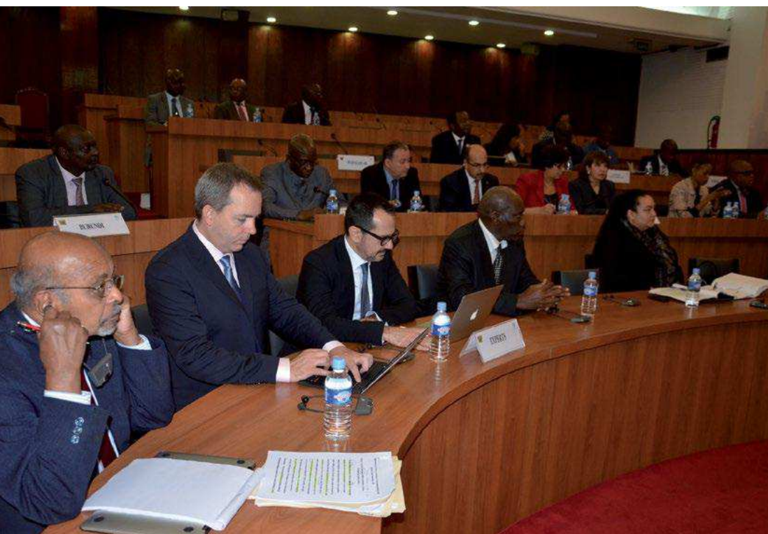
Experts from the 1540 Committee and the UN Office for Disarmament Affairs also contributed to the organization and discussions.

existing structure which has a similar mandate – a body responsible for nuclear, biological and chemical weapons or counter-terrorism, for example. Whichever option is chosen, it is important that the coordination structure have a clear mandate relating to the scope of Resolution 1540 and a place within the state's institutional structure that vests it with the necessary authority to ensure that all stakeholders can contribute accordingly. The structure should also have sufficient human and financial resources at its disposal to fulfil its mission and should additionally be subject to a reporting mechanism to enable information to be made available on its progress and any difficulties that arise. Some states have established very successful coordination structures, but it must be noted that the prevailing situation at present is such that coordination is either lacking or insufficient.