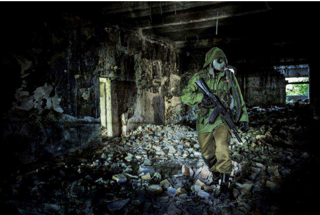
MPs from across Africa recommended fresh action to halt the spread of weapons of mass destruction.

This is the context in which Resolution 1540 calls on governments to implement effective laws and regulations to prevent non-state actors from gaining access to WMDs. Under the resolution, states shall, in particular: