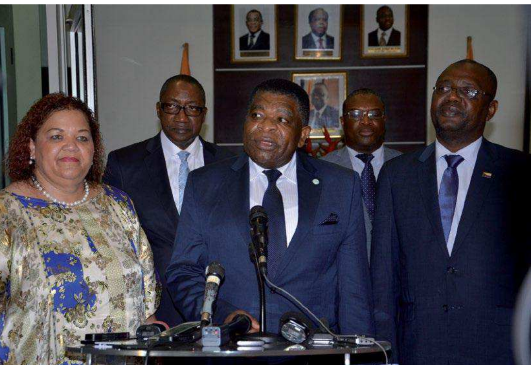
IPU Secretary General Martin Chungong explained that: "The danger of terrorist groups making use of weapons of mass destruction to advance their criminal causes is very real."