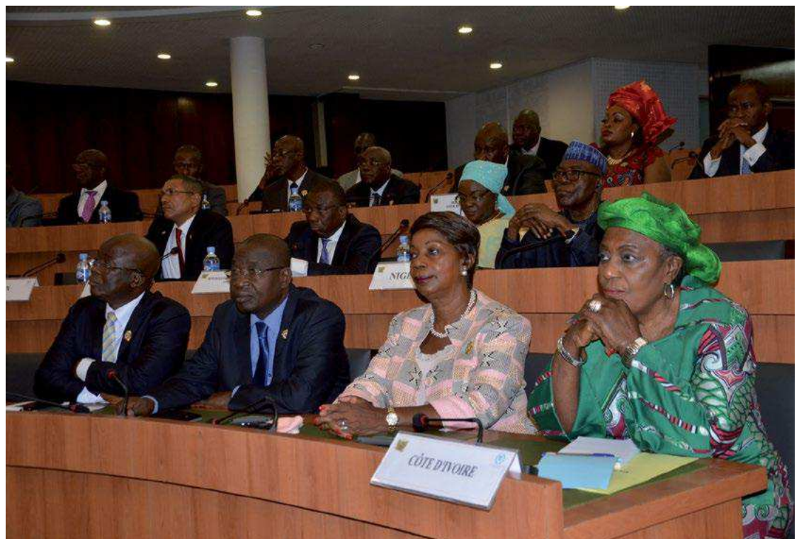
The event was jointly organized by IPU and the Parliament of Côte d'Ivoire.

The challenge with security-related matters is that, while being interesting topics for debate, they are more difficult to tackle in practice unless they pose a direct threat to a state. At the regional level, parliamentarians can consider this issue in very different ways, depending on whether there is at least one country in the region where non-state actors are clearly active, or whether one of the governments is involved in combating terrorism. In addition, parliamentarians tend to be very busy and may have many other priorities that their constituents consider more important. Indeed, challenges such as climate change, unemployment, the national debt, a natural disaster or a health crisis such as Ebola are perceived by the public as more tangible issues in which they have a greater interest. This is where the role of parliamentarians as representatives and providers of information should come to the fore. By discussing matters with interest groups, civil society, vocational training organizations and the business community, parliamentarians will be able to explain the stakes involved in implementing Resolution 1540 and how absolutely necessary it is.