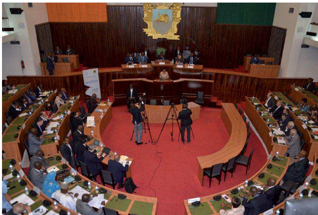
The national television broadcast parts of the meeting to increase public awareness of the resolution.

The first of these tools could involve establishing a formal coordination structure, which could either be set up as a dedicated entity or be integrated into an