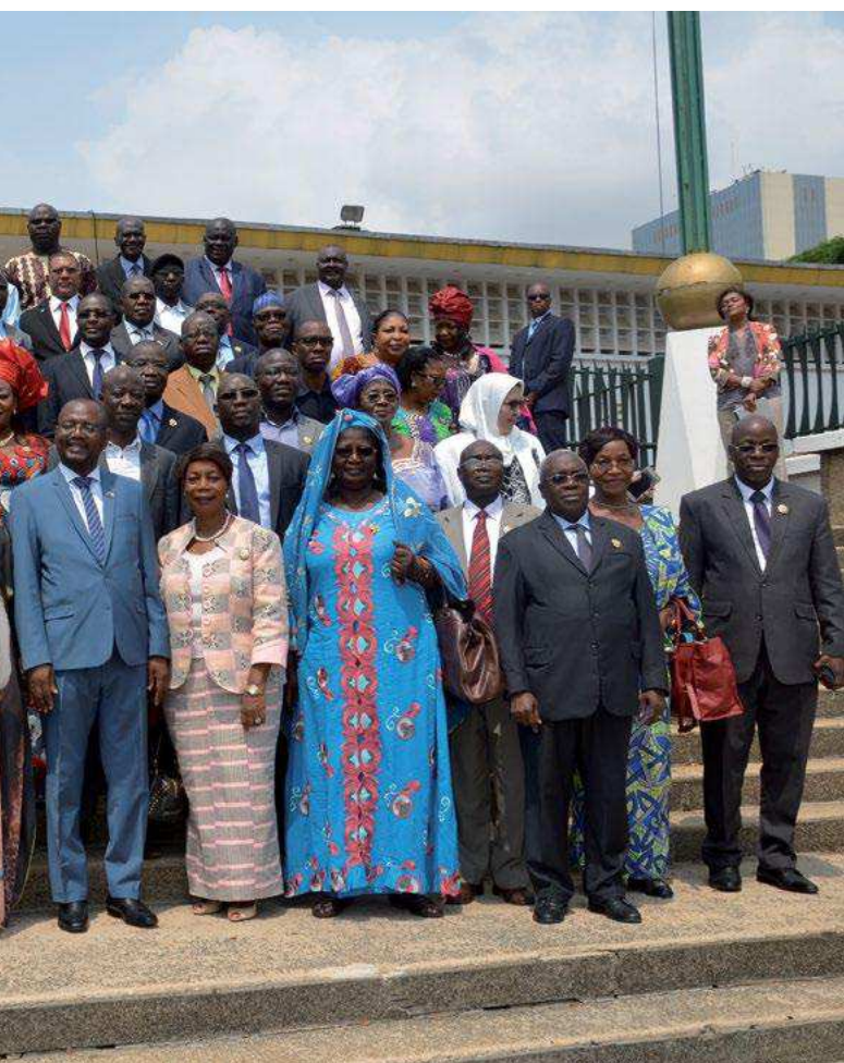
More than 70 MPs from 18 countries took part in the seminar, the first event to bring together MPs from one continent to discuss the implementation of UN Resolution 1540.

Guillaume K. Soro, President of the National Assembly of Côte d’Ivoire