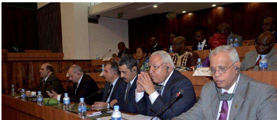
Egyptian parliamentarians took part in the seminar as one of their first initiatives towards rejoining IPU, after a five-year absence.

Tackling the root causes of terrorism is vital if we want to stop it from spreading and continuing to attract new recruits. Parliamentarians and governments contribute to reducing that threat when they deal with the problems of youth unemployment and national-level corruption, and when they promote development and good governance.